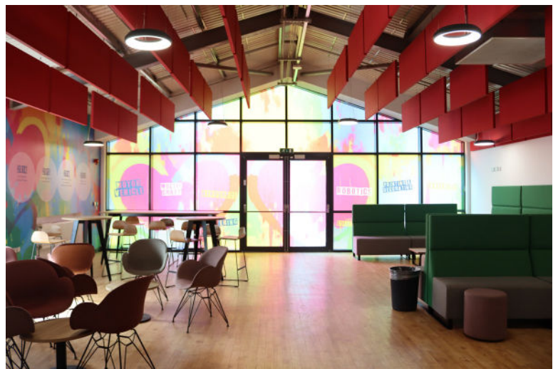
Example of new entrance option